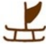
CHART YOUR LIFE'S COURSE