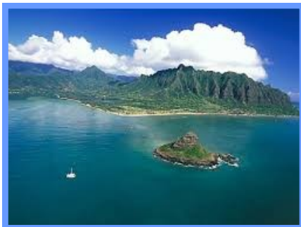
Chart your own course on the Windward side of O`ahu from Kahalu`u to Makapu`u Point. This open ocean blue water adventure includes trolling, swimming and schooner games. Or mix business activities with experiential learning, team games, and recreation in an unforgettable day of adventure at sea.

Half Day Sails: Three hour sail (morning or afternoon). Price: Starting at $1,000 for up to 20 passengers.