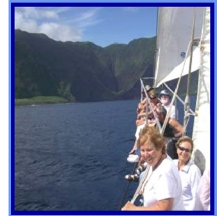
Chart Your Own Course aboard the sailing school tall ship SSV MAKANI OLU